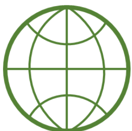
Broad Spectrum - Performance Across Multiple Cell Types